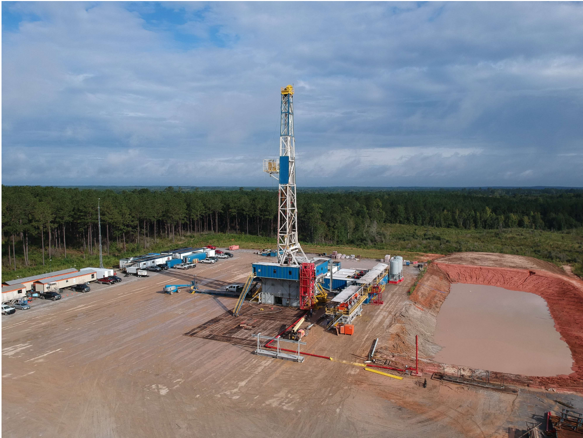
Figure 1: Nabors B14 on the Stewart/Bergold location during rig up.